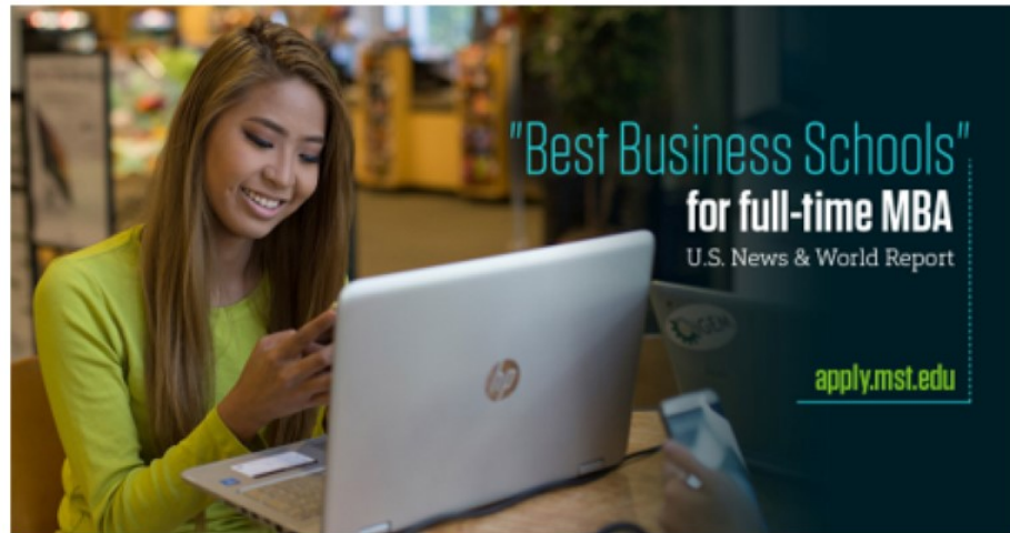
Current social media ad for MBA program

U.S. News & World Report's "Best Business Schools" (full-time MBA)