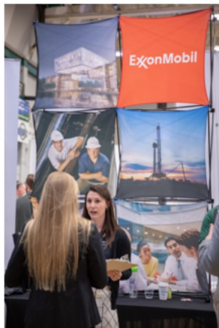
Missouri S&T Career Fair