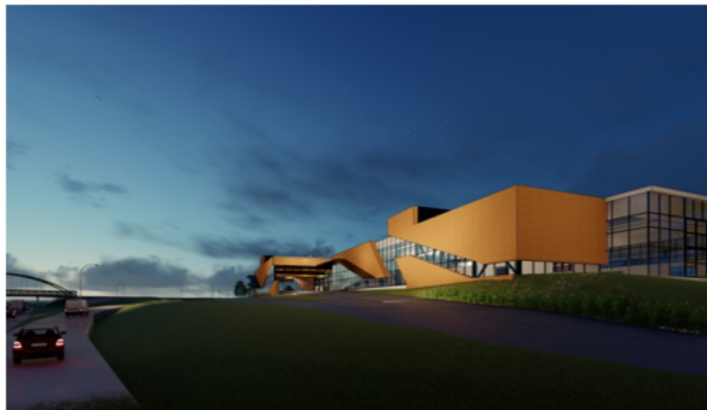
Architect's rendering: Systems Integration and Prototype Development Facility (view from Interstate 44)