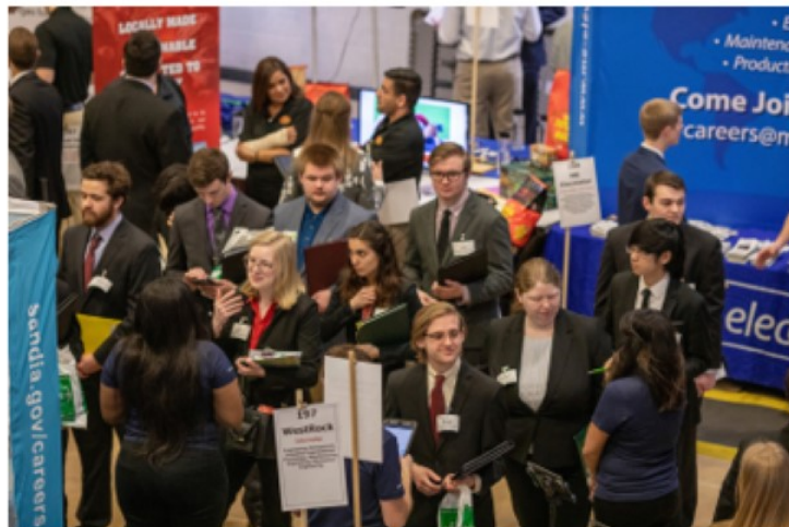
Missouri S&T Career Fair, February 2020